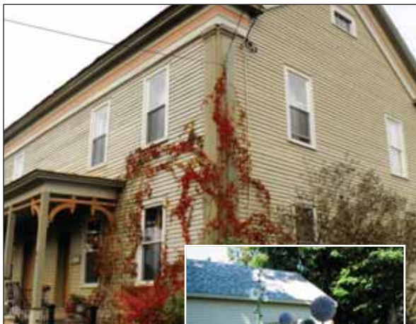
Scenic Landscapes & Garden