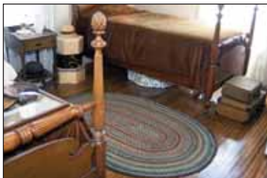
Accommodations and Meals Included.

Students will learn the steps in making a round, oval, and square rug. The weekend price is all inclusive: twelve hours of lessons, a kit for a 2' x 4' rug of your choice, needle, twine, clamp, instruction booklet, sleeping accommodations, meals, beverages, unlimited phone calls, and use of the internet to retrieve your messages.