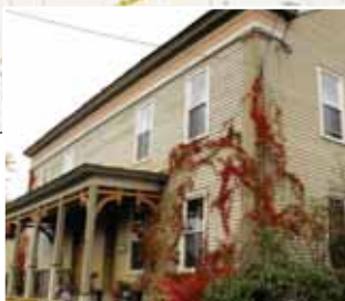
The Historic Grange In Parishville