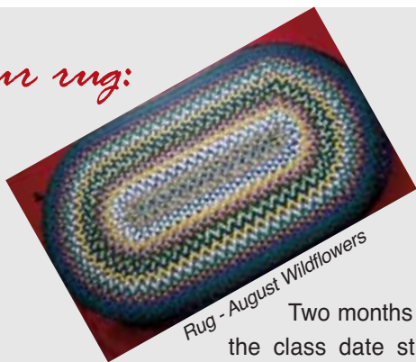
Rug - August Wildflowers

Two months before the class date students are asked to choose the rug they wish to make from the selection on the web site: www.adirondackrugbraiding.com . If none of the rugs fit your color scheme a personal one will be designed for you. The entire kit will be ready for you upon your arrival.