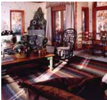
The Big Rug - 15'x18'